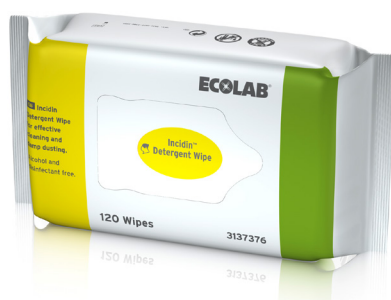
Incidin™ Detergent Wipe 120 WIPES FLOWPACK